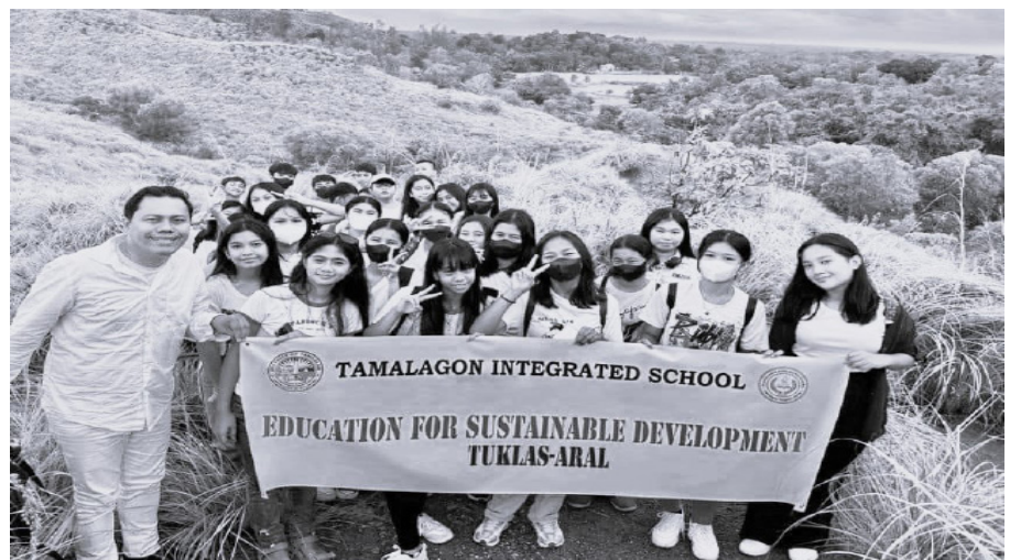
(Turn to page 7)

Aniya, "If we want to achieve sustainable development, we need to educate the learners to be na inaasahang makakatu-